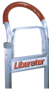
Loop Available in 50"