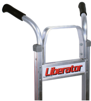
Flared Double Pin Grip Available in 48", 52", 55" & 62"