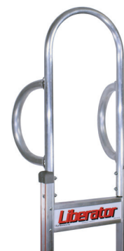
Double Flared Loop Grip Available in 55" & 60"