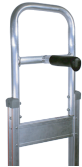
Single Pin Grip* Available in 52", 55", 62" & 68"