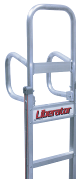
Double Vertical Grip* Available in 55", 62" & 68"