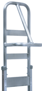
Horizontal Grip* Available in 62"